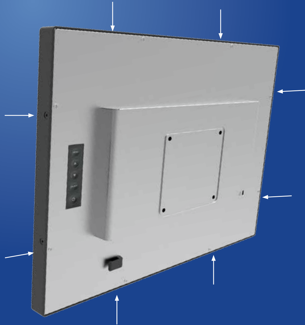
Vesa 100x100 mount or bracket mount