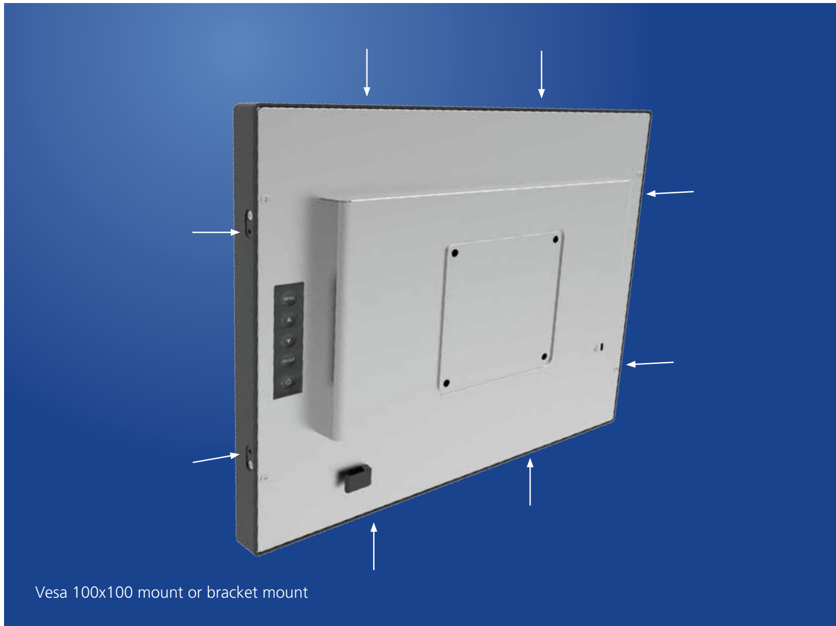
Vesa 100x100 mount or bracket mount