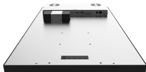
POWER ADAPTOR WITH BRACKET